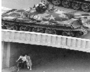
Soldiers set up a road block to check if anybody are college student leaders that had lived.

Soon soldiers moved in, but citizens held the personnel carriers back. After trying twice to get in Tiananmen square, the soldiers were each time denied access by students and citizens.