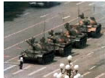
A protester is standing in front of four tanks and not letting them through.

After some time the news finally got out that the government had massacred over 150 thousand and got hate mail from lots of organizations across the world.