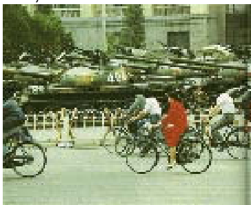
Tanks and armored personal carrier moving in to position to attack Tiananmen Square

Some weeks after, the President of Russia had arrived in Beijing to tour China and all of Beijing. But the tour of Tiananmen square was canceled, because the college students had started a hunger strike. Many of the students had to go to hospitals during that time. After the president of Russia had left Beijing was declared under martial law on May 20th, 1989.